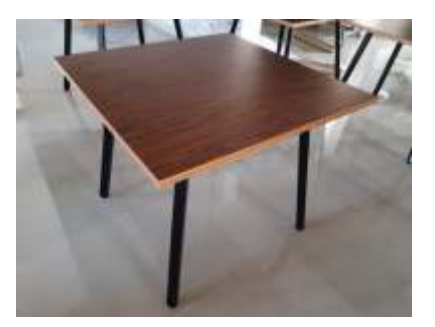
Cafeteria table for four seater