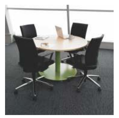
Prelam round table with Steel round base