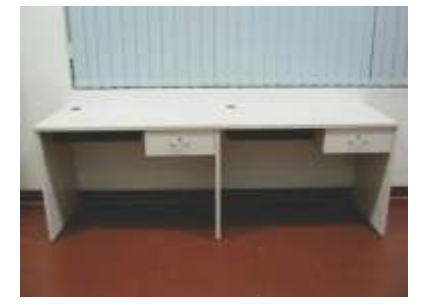
Free standing table with Keyboard tray and single drawer