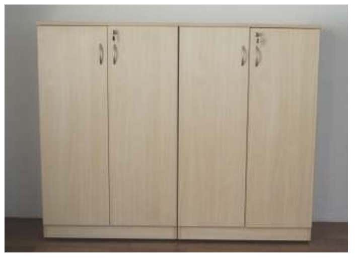
▼ Prelam cabinet with openable doors