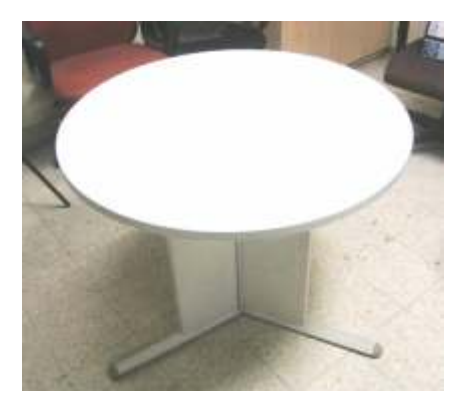
Prelam round table with steel legs