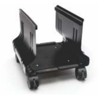
Metallic CPU Tray 🔺