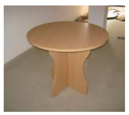
Prelam round table