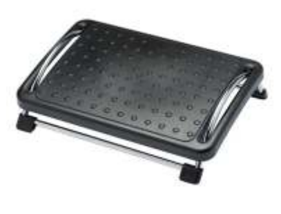
Foot Rest 🔺