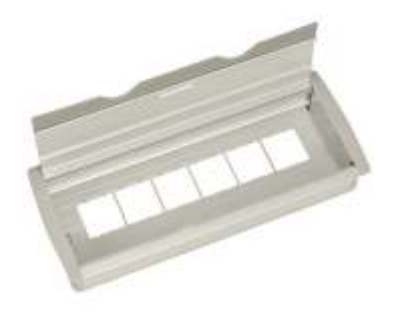
Access Flab 12 Module 🔺