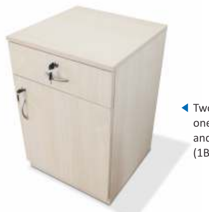
Two drawer pedestal with one drawer above and open able door below (1B + 1F)