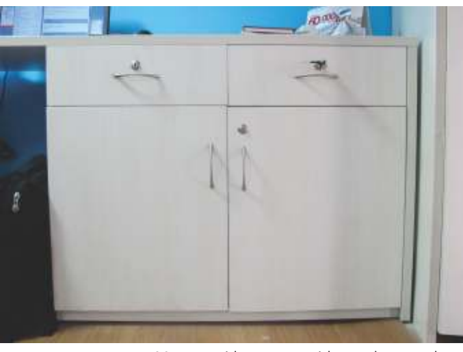
Manager side storage, with two drawers above and two openable doors below