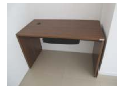
Free standing table with keyboard tray